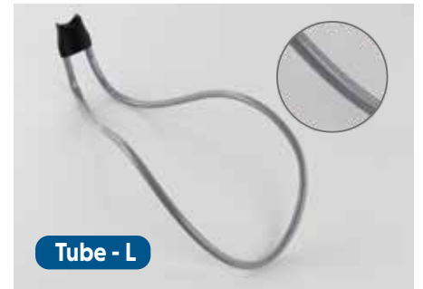
Tube - L

Middle neck-tube cost-effective solution.