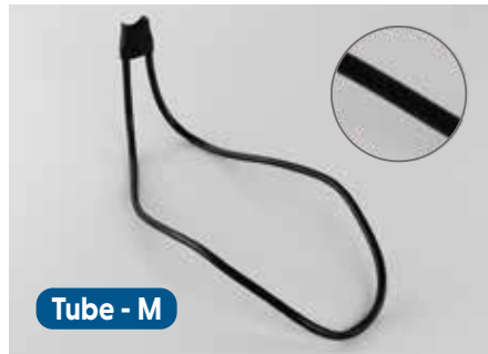
Tube - M

Watch & use your smartphone like never before.